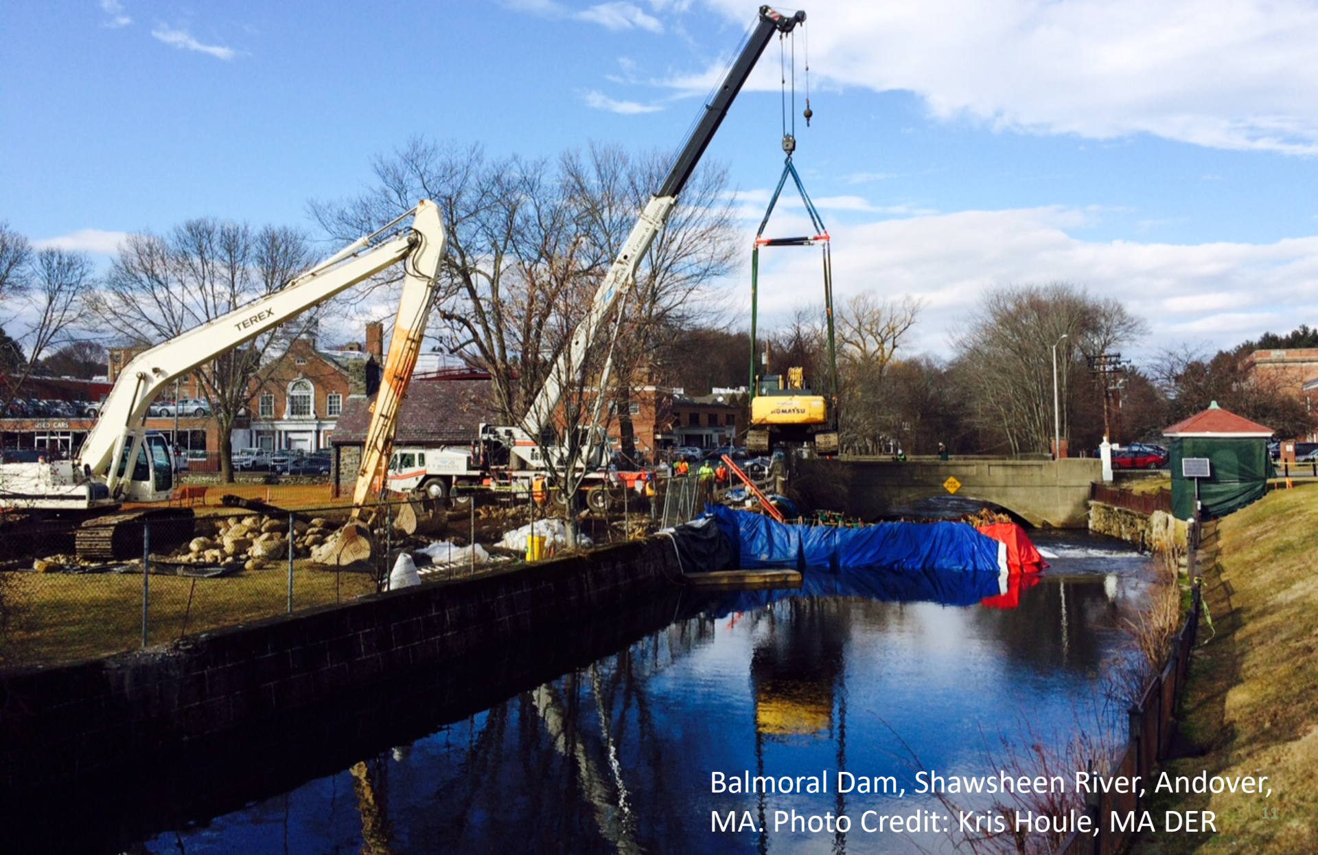
Balmoral Dam, Shawsheen River, Andover, MA.